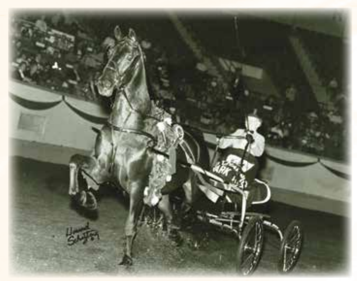
One of only two mares to ever win the Park Harness World Championship, Van Lu Jolie won the title in 1986 in addition to winning the Ladies Park Harness World Championship and the Ladies Park Saddle World Championship that year.